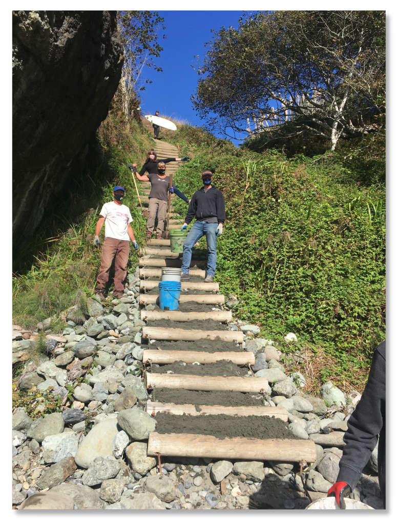
Volunteers working hard to stabilize the steps at our annual Houda Point Stewardship Workday.

There are more exciting endeavors on the horizon for the Land Trust. Currently, we are entering into the planning process for a new strategic chapter , an incredibly exciting opportunity to reevaluate what our concept of coastal access really means, take an assessment on which communities we are serving well and who we need to include, and brainstorm as a community as to how our aspirations will be achieved in reality. We are learning the immense value and importance of including stakeholders in the budding stage of a planning process and letting input guide our direction. We will also be seeking to learn how TCLT can better support the endeavors of our community partners. This spring and summer, the Land Trust board and staff will identify stakeholders relevant to our work, participate in conversations to gather input, listen to stakeholders' needs and aspirations, and ask how we can better support and serve the community and the land. These inputs will then be used to create goals and plans for actions. While this is a great opportunity for growth, it is also a great responsibility for the TCLT to hold ourselves accountable. We welcome input from those reading this on the vision you see for our organization, our community, and the Trinidad coast.