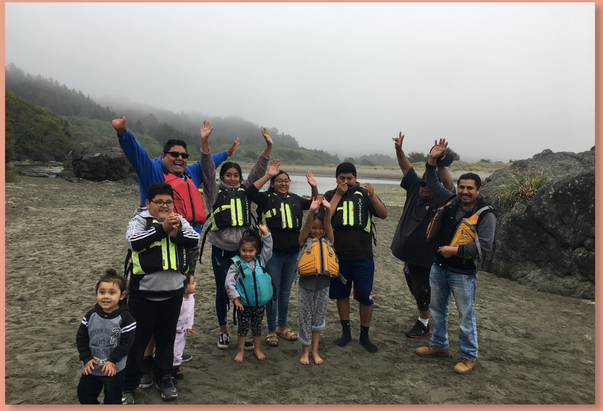
Participants at Pequeño Río, ¡Gran Aventura! which was a bilingual family fun kayaking and beach play day at the Little River.