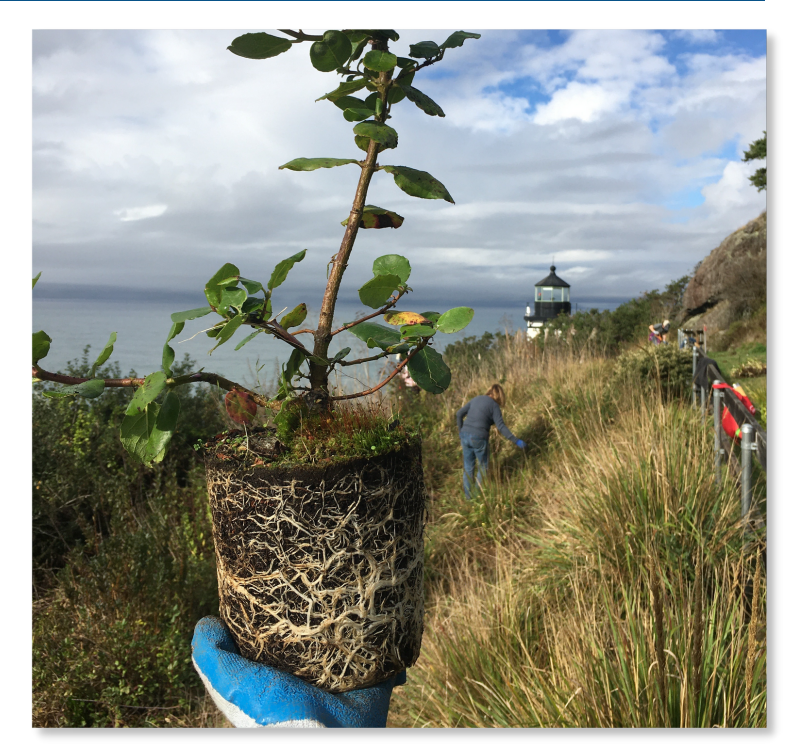
Coastal silk tassel planted at the Trinidad Lightouse Stewardship Workday in collaboration with the Bureau of Land Management.

Looking forward, we are on track to complete the planning stage for public access improvements at Tepona Point and Luffenholtz Beach supported by the Wildlife Conservation Board and informed by community input. Improvements will include a reconfigured and safer parking area, a portable restroom, an ADA accessible ocean vista, interpretive displays, picnic area, and native plant gardens. These improvements paired with our Houda Point public access project, will further increase the accessibility of our coastline by offering ADA compliant ocean vistas and recreational areas. Additionally, our planning is intended to improve public safety and increase educational opportunities. With the collaboration of many project partners, including Redwood Community Action Agency, Cal Trans, and SHN, we are continuing to move forward with planning for the Little River Trail, which will close a key gap in the California Coastal Trail by linking the Hammond Trail with Scenic Drive.