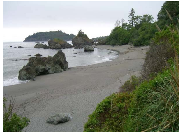
Baker Beach, Land Trust Property, Trinidad Head in background

"I give the Humboldt North Coast Land Trust, a 501(c) (3) Nonprofit Corporation, Tax ID# 94-2552913 incorporated in the State of California, and having its principal offices at PO BOX 457, Trinidad, CA 95570 the sum of $_____ (or alternately, _____ percent of the residuary of my estate), for its general purposes to protect and conserve land and water resources for public benefit."