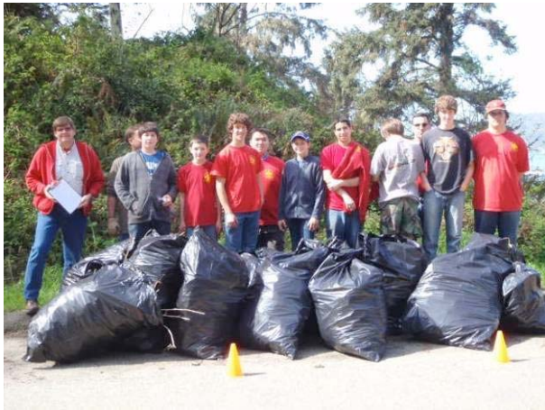
Local Eagle Scout Troop with trash bags full of invasive ivy, near Baker Beach. Thank you!

Our all-volunteer Board of Trustees continues to monitor our properties and identify specific areas for trail improvements and non-native plant removal. English Ivy is a growing problem on almost all our properties. Volunteer groups are needed to take on ivy removal. If anyone is interested or has ideas to share please contact us.