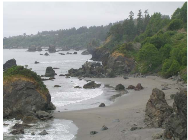
Land Trust donated Property: North Luffenholtz Beach

Last but definitely not least, our land trust has been gifted the 'Saunders Park' parcel in Trinidad where in partnership with the city, Trinidad Museum Society, Friends of the Trinidad Library and numerous volunteers we are building a community center including the museum, library, a native plant garden and a city park.