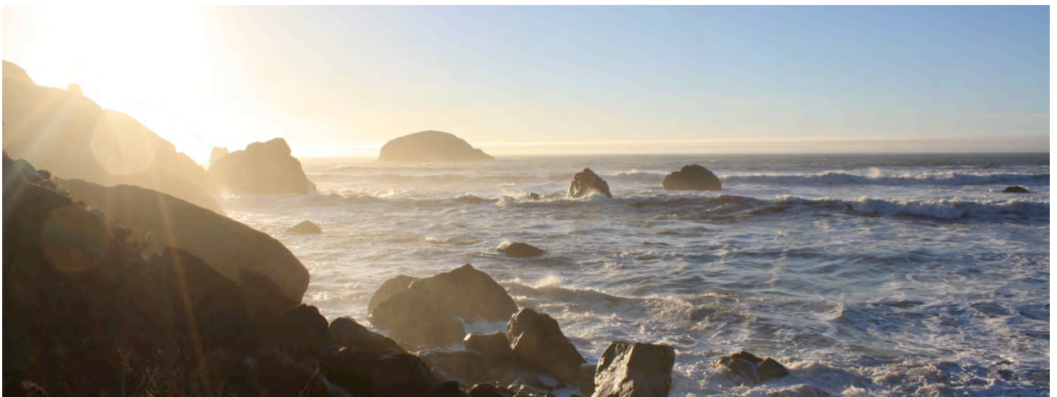
View from the end of the Martin Creek Trail

Don't forget - our annual meeting will be held at the Trinidad Muesum on Sunday, Decmeber 15 th at 3pm. All are welcome and we hope to see you there or hear from you soon; check out our Facebook page; watch for updates at our website and encourage your friends to attend or become new members. Also, please don't forget to return your voter ballot and membership donation form. Thank you!