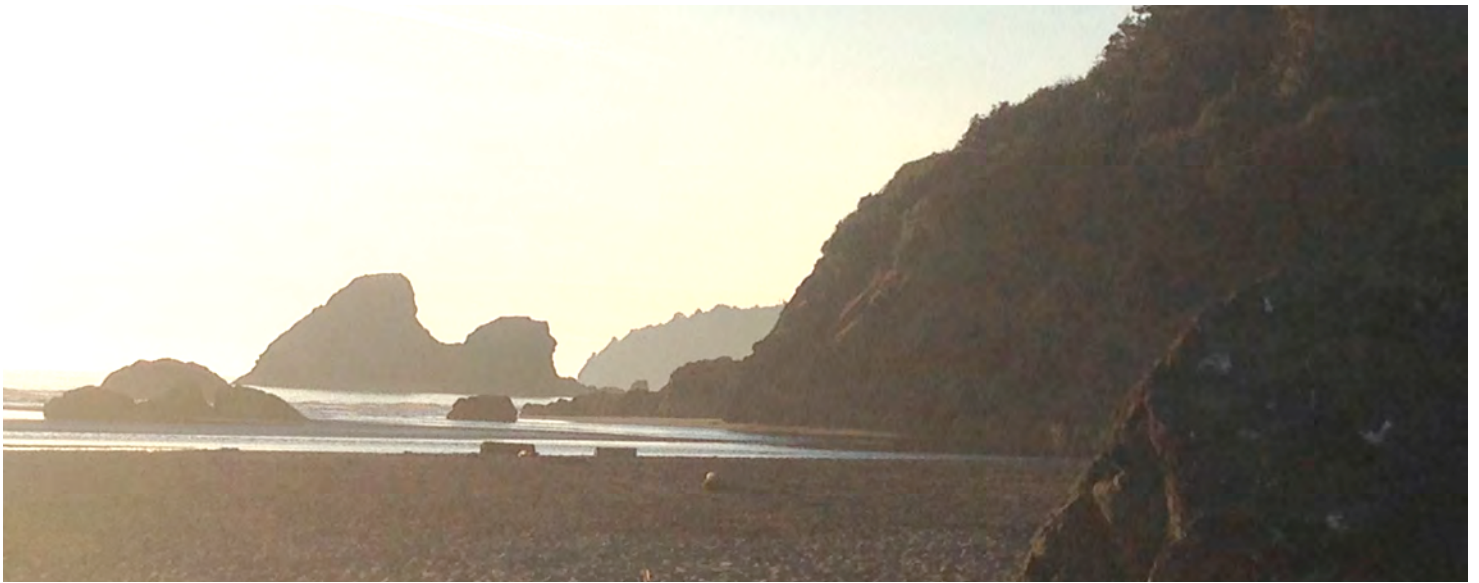
The view of Pilot Point, on the right, and Camel Rock from TCLT's Moonstone Beach easement