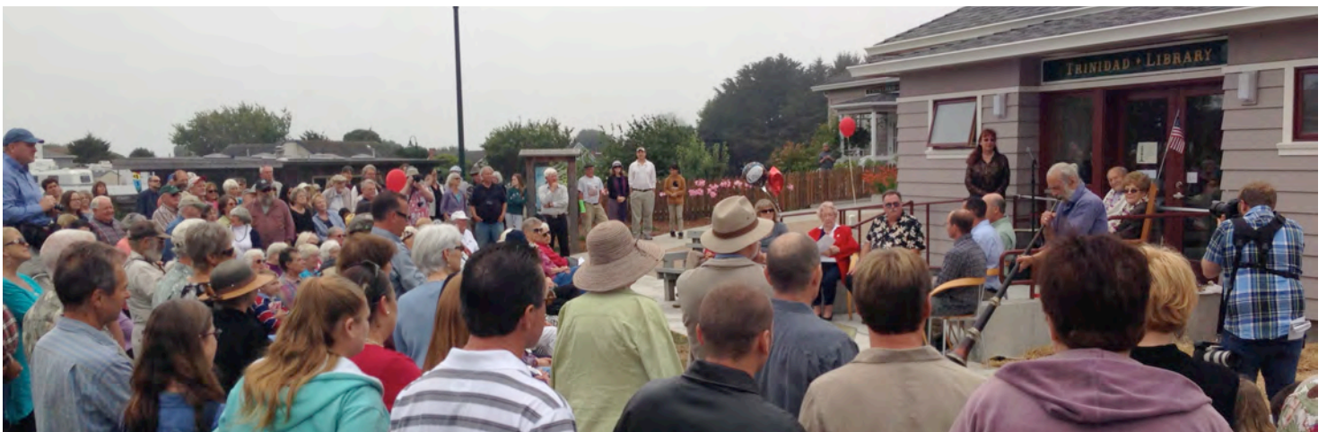
Grand opening of the Trinidad Library