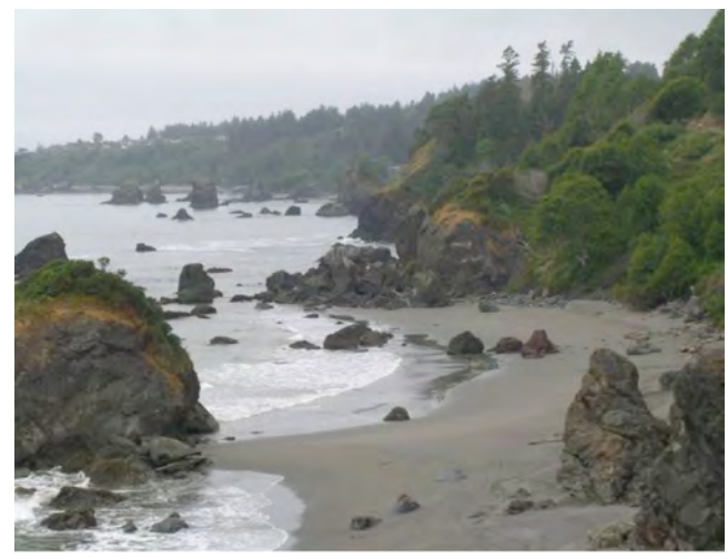
Land Trust donated Property, North Luffenholtz Beach

Acknowledgements: A big thank you to the Trinidad Rancheria for donating approximately 100 feet of untreated wood decking from the old Trinidad Pier! These 4"x12" planks will be used for future trail restoration/maintenance projects.