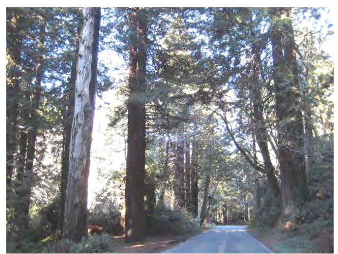
TCLT preserves the 2-acre 'Bruno Growth Redwood Grove' along Scenic Drive, just south of Trinidad.