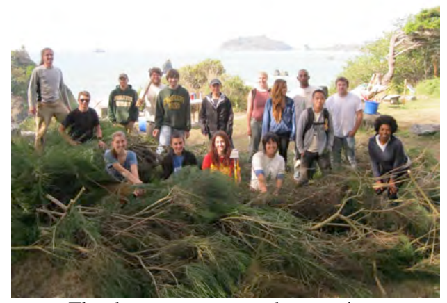
Thanks to our super volunteers!

As part of the Land Trust's mission to preserve the natural beauty and biodiversity of our property holdings, we periodically hold work days to remove invasive plants, primarily the dreaded English Ivy (Hedera helix), Andean Jubatagrass (Cortaderia jubata) and Scotch Broom (Cytisus scoparius); contrary to common usage, it is primarily Jubatagrass in our area that is the problem, not Pampasgrass (Cortaderia selloana). The Land Trust has long been aware of the problem of invasive plants and has documented the presence of these species on our land holdings as part of its "property monitoring" obligations. In March of 2011 the Trust passed a resolution committing to "working through itself and other interested groups and individuals to stop the spread of and eventually to eradicate non-native plant species from its land holdings and from other open space areas in Northern Humboldt County". In recent years we have worked mainly on our three largest holdings: 1) Pilot Point, the headland at the north end of Moonstone Beach: 2) Baker Beach; and 3) Houda Point (Camel Rock). This year, in collaboration with