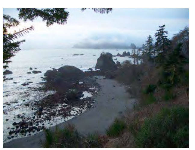
Baker Beach and Trinidad Head

community. Aside from being one of the most scenic vistas and best surf spots in Humboldt County, Camel Rock is home to the largest breeding colony of Leach's Storm Petrels in California. Moving north, in 1979 the Land Trust received the North Luffenholtz Beach property from Georgia Pacific Lumber Company. This property adjoins and is accessed from the Luffenholtz County Beach Park and is a fantastic family and surf-fishing beach.